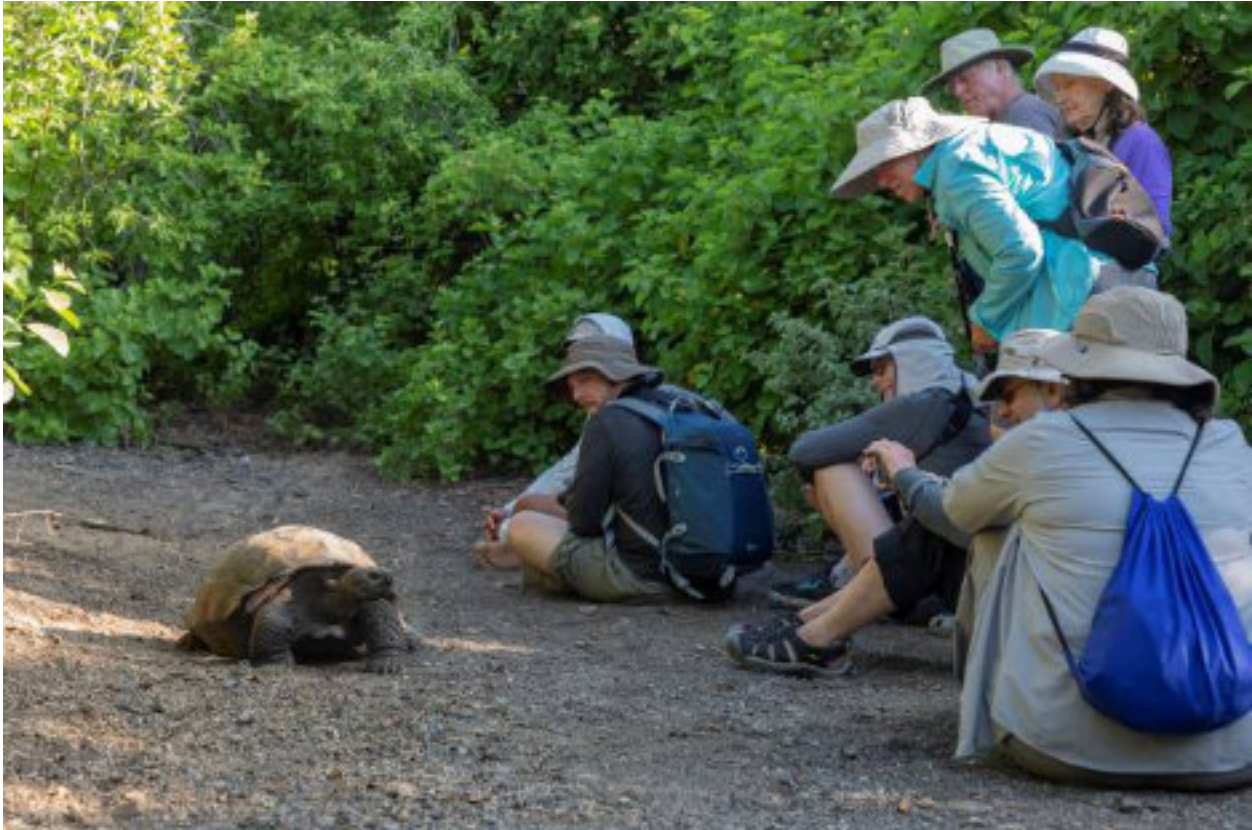
Galapagos tortoise checks out a group member