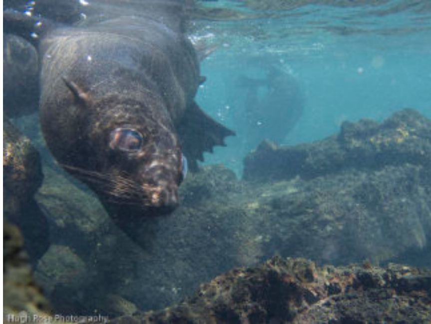
Friendly Galapagos fur seal at Marchena Island