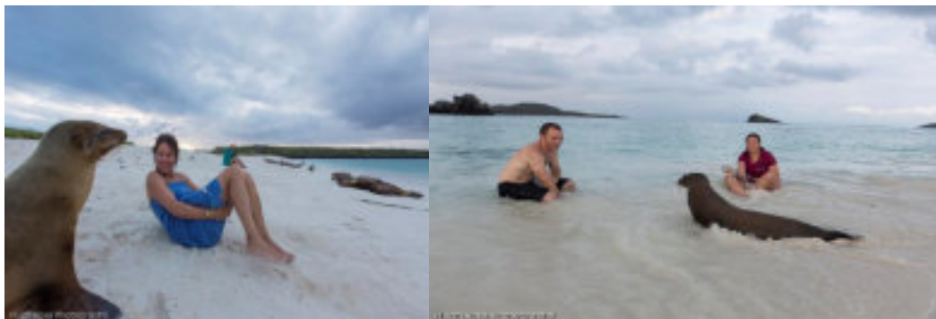
Friendly Galapagos Sea Lions!

Depending on weather conditions, either at the end of the morning walk or early in the afternoon we will snorkel, kayak or SUP around Gardner Island. Its calm waters and attractive landscape give you a great experience above and below the water! Later in the afternoon we will land on the famous sandy beach of Gardner Bay. Located on the north coast of Espanola Island, Gardner Bay has a half mile long white sand beach perfect for walking, swimming, and lounging with the many playful resident Galapagos sea lions and friendly Hood Mockingbirds