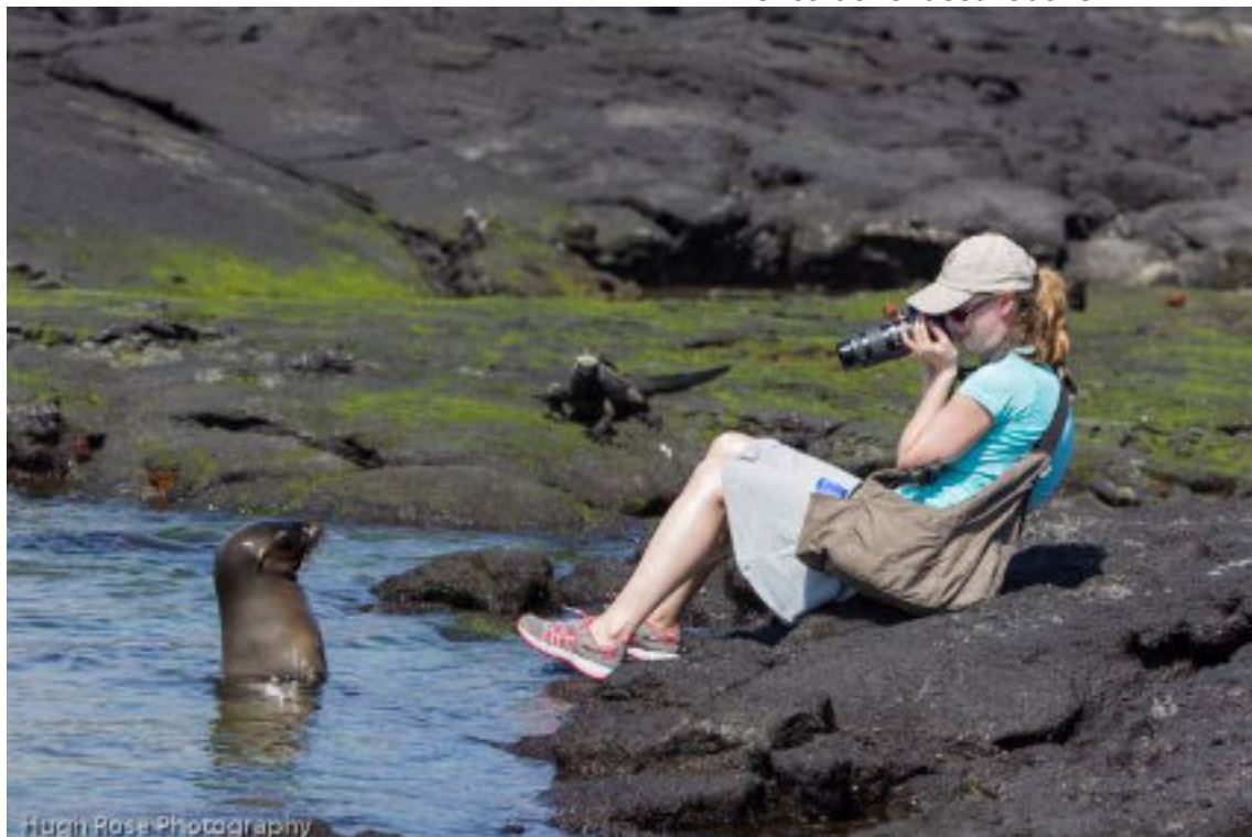
Friendly wildlife of the Galapagos