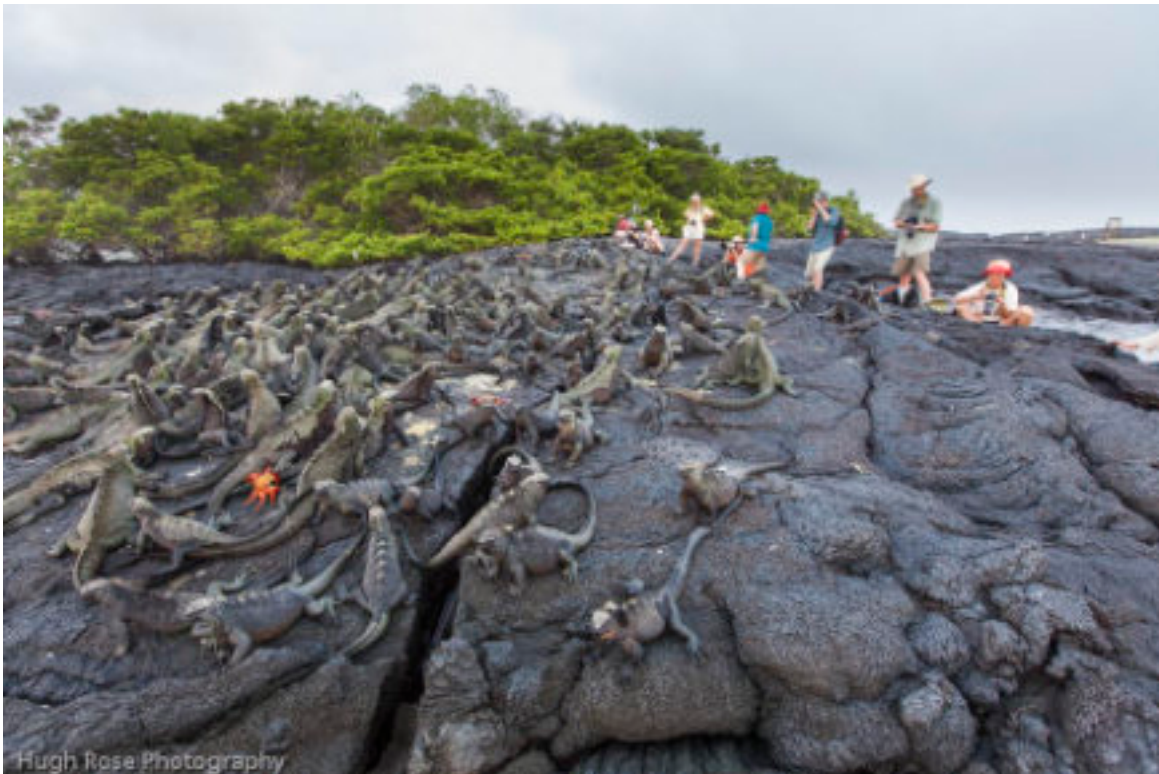
Marine Iguanas basking