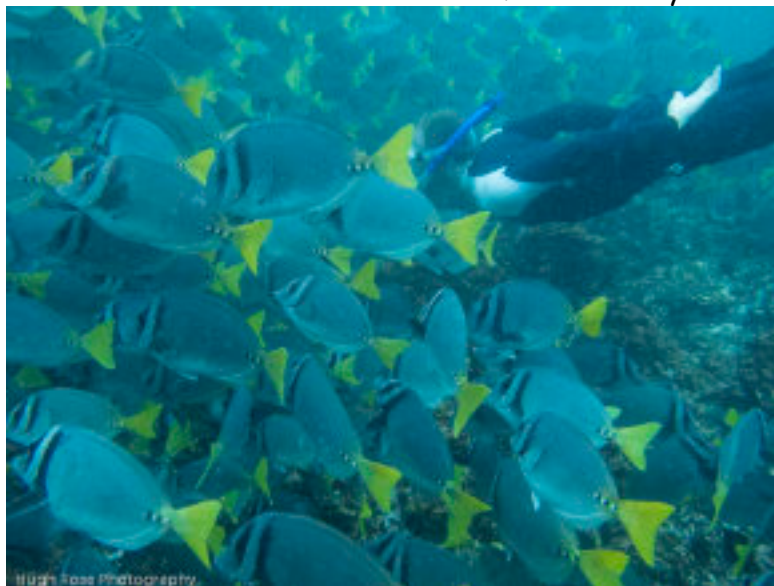
Snorkeling with Yellow-tailed surgeon fish