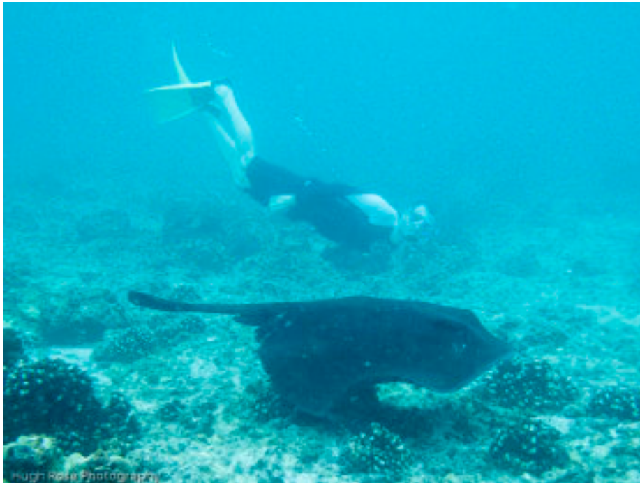
Snorkeling with a ray

It is always a good idea to do most of your packing the previous night so you can have a pleasant last early morning visit and a relaxed breakfast. We will board our flight back to Quito and bid the Galapagos farewell!