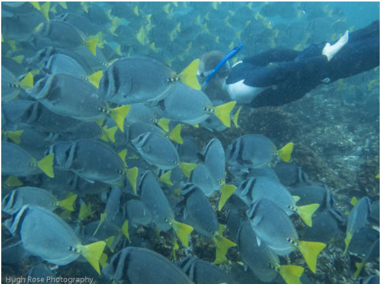
Snorkeling with Yellow-tailed surgeon fish

All other tour boats that sail in the Galapagos will sail back south after visiting Tower Island, not the Samba! We are the only boat that sails west-northwest toward the island of Marchena after departing Genovesa. The Galapagos National Park Service granted us the chance of using Marchena's magical shorelines to snorkel, panga ride and kayak. In recent times, only scientists have reached the land of Marchena, where forbidding endless and untouched lava flows combine with no fresh water and very little precious soil, to make a foreboding, but beautiful landscape. The serenity of Bindloe is only disturbed by the murmur and surge of the Pacific swells and musical argument of the cavorting sea lions. Punta Mejía is one of the best sites in the Archipelago to snorkel. The calm and clear deep blue water of the north-west coast, and the dark hostile background topography of the island give the sensation of witnessing the beginning of our planet and its underwater world. Apart from great fish diversity, when we snorkel, we often see rays, hammerhead sharks and sea turtles.