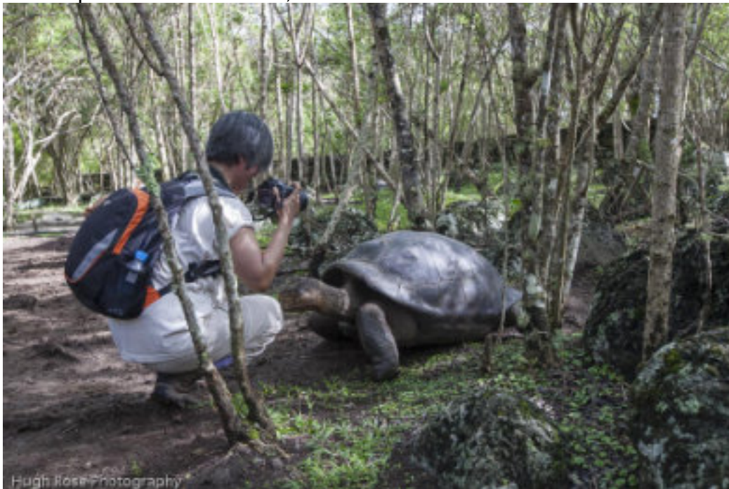
Galapagos tortoise checks out a group member

Charles, Floreana and Santa Maria are all official names of this Island that holds an overwhelmingly rich human history compared to other islands in the archipelago. After breakfast we land at Post Office Bay , home to the mailbox that has been in use since the early 1800's when Nantucket whalers would leave mail to be taken back home by whaling vessels returning after multi-year whaling expeditions in the South Pacific. For the more adventuresome we can descend into a lava tube that traverses many feet towards the ocean and is connected to salt water with the tide rising and falling in this unique geologic feature. After departing Post Office Bay, we will kayak, SUP or dinghy ride to the beach below the Baroness's Lookout . On top of this eroded spatter cone, we will hear the fascinating stories of the three families that settled on Floreana in the late 1920's and early 1930's (the Wittmer family, Dr. Ritter and his mistress Dore and the famous Baroness and her three lovers). Juan Manuel will spin the tale of conflict, murder and mystery that ensued in one of the great mysteries of the Galapagos Islands and now the topic of a recent movie, "When the Devil Came to Eden"