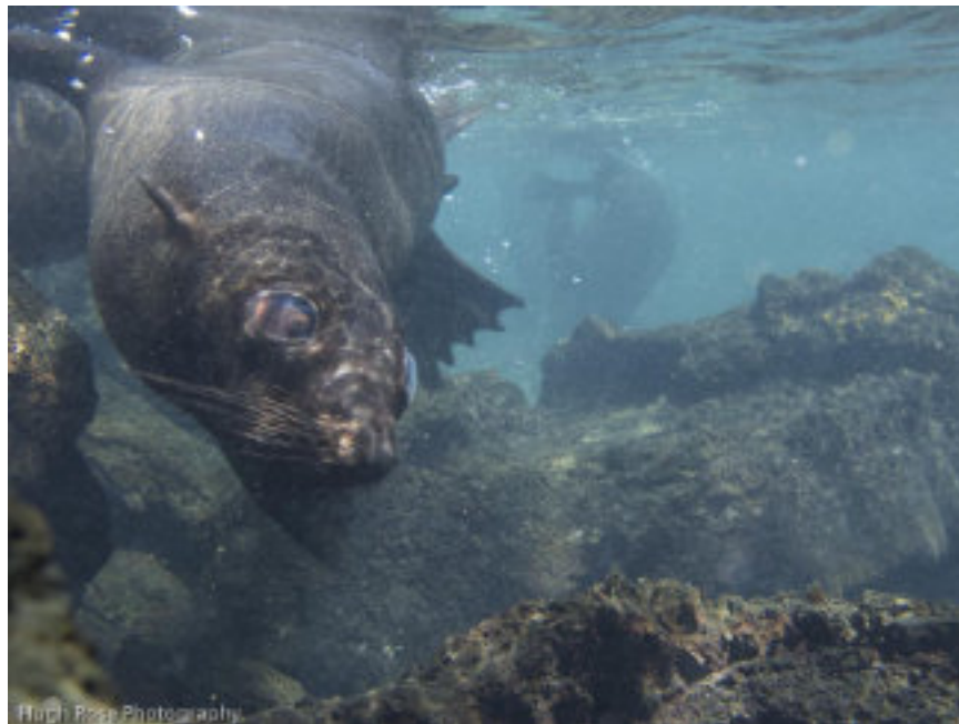
Friendly Galapagos fur seal at Marchena Island

water, and pups from a small colony of fur seals found in this grotto are curious of these rare human visitors often venturing over to check us out! The Galapagos fur seal is the smallest of all the seal species in the world and evolved with no human predators, so they have no fear of us. The young seals love to swim around snorkelers coming up to our masks where they blow bubbles in our faces! After returning to the Samba, we begin a 5–6-hour sail to the west. As we navigate west and away from the island, the sea floor drops off dramatically and we cross a 3,000-foot underwater cliff! The Cromwell current flows from the open Pacific to the west and brings oceanic deep water welling up against this submarine precipice. This upwelling brings cold, nutrient rich water to the surface and creates unusually food rich, productive water. As a result, the ocean we transit on this navigation attracts many marine creatures and birds to feed on this abundance of food and we make the navigation during the afternoon to be able to watch for large cetaceans and other oceanic wanderers.