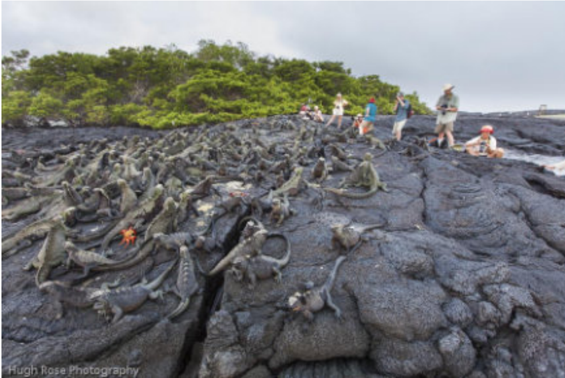
Marine Iguanas basking